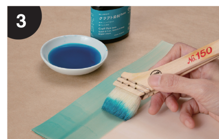
3 Dye evenly while changing the direction of the brush