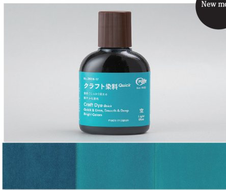
Undiluted solution Undiluted solution+water (1:5) Undiluted solution+water (1:10)