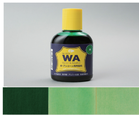
Undiluted solution Undiluted solution+water (1:5) Undiluted solution+water (1:10)