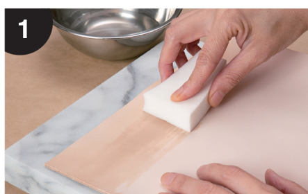
1 Moisten the entire leather with a sponge