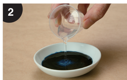
2 Mix the dye to your desired color