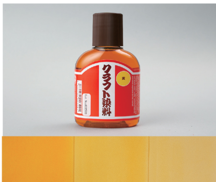
Undiluted solution Undiluted solution+water (1:5) Undiluted solution+water (1:10)