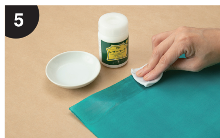
5 Apply leather coat two or three times to fix the color

The colour will appear darker when the leather is damp, so allow it to dry before testing and applying more coats until you reach your desired colour.